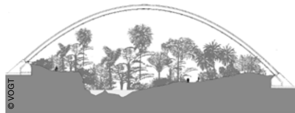
cross section through the hall

The first impression on entering the rain forest of the hall is its exotic climate. Warm, heavy, and humid air envelops visitors and plants alike. The humidity is immediately soaked up by the protective clothing. Constantly changing scents of mould and blossoms confuse the senses. The sonorous roaring of the waterfall gradually increases until it is, all of a sudden, visible between the trees in the distance. Twittering and chirping add their own mood to the uniform background noise and suggest the presence of cicadas and birds. Full of promise, fruits draw us to the trees, but only the animals succumb to their attraction. The visible is only part of this exotic world. The old familiarity of our daily environment is called into question. Ultimately, what we see dissolves and our glance is lost among finely crafted palm fronds, mighty tree trunks, and the constantly changing play of light and shade.